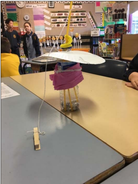
Task Description "Box of Bits"