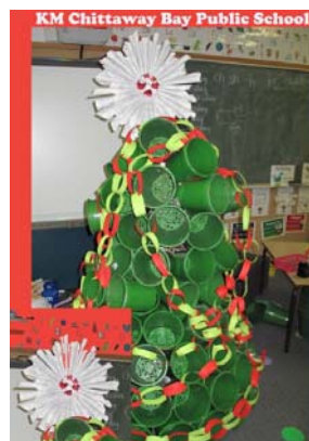
KM's recycled Christmas Tree